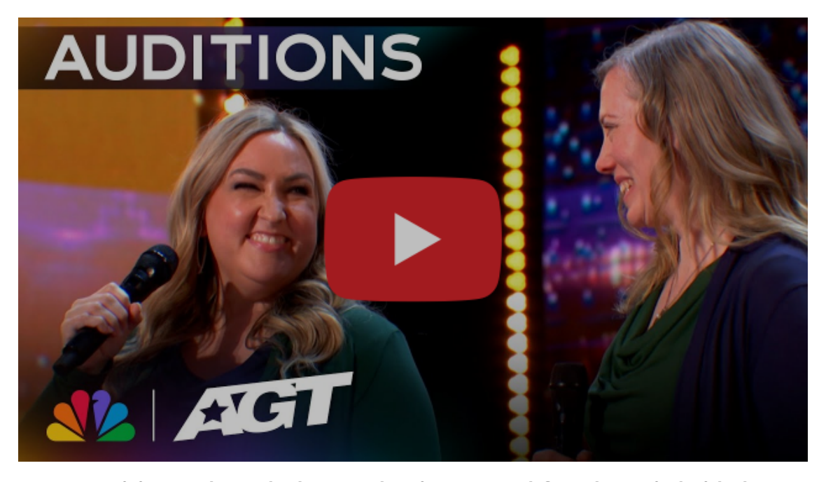
A recipient mother and a donor mother sing 'Too Good' from the musical Wicked

An emotional moment with huge impact on the NBC competition show