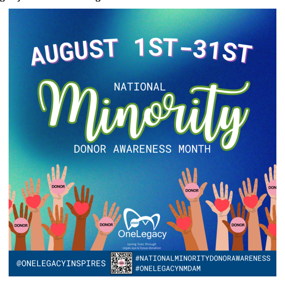
Download Tool Kit Here