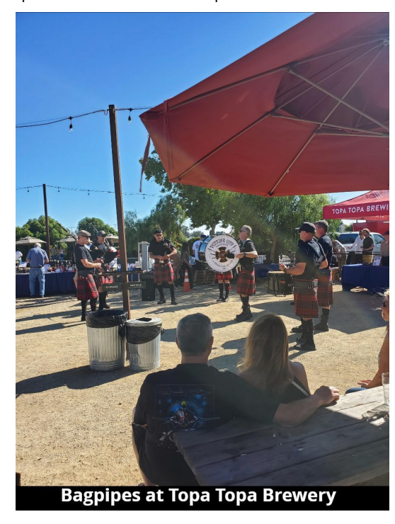
Watch The Video Here