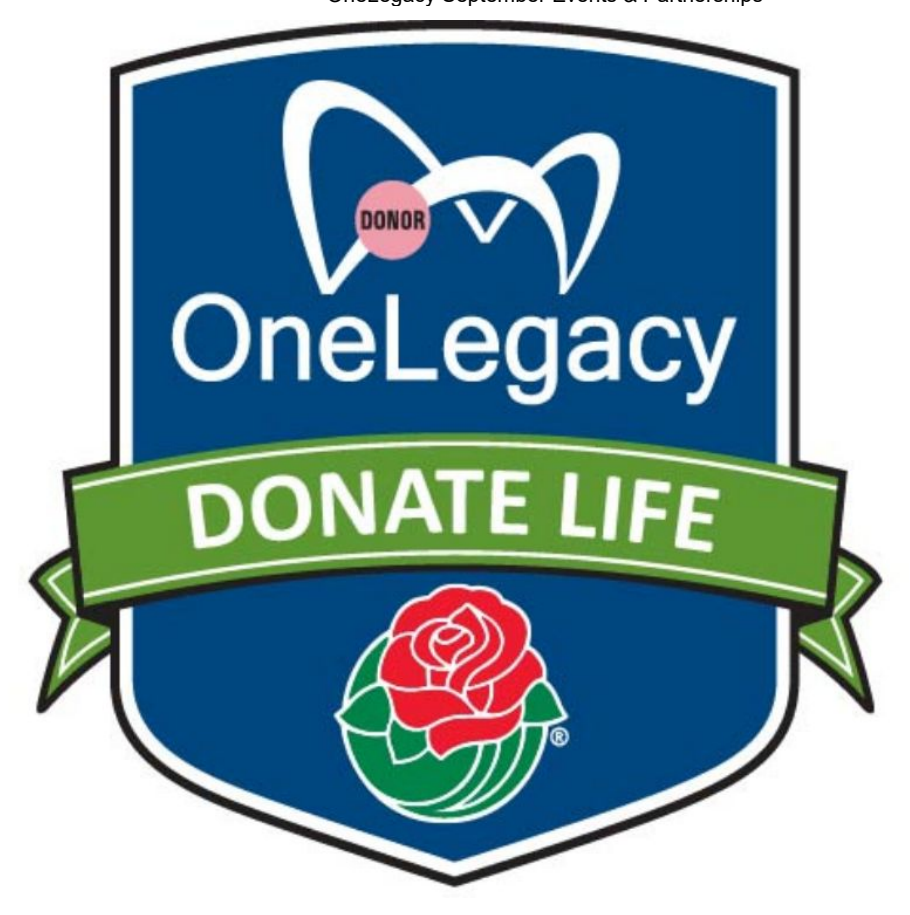
2024 OneLegacy Donate Life Rose Parade Float Logo