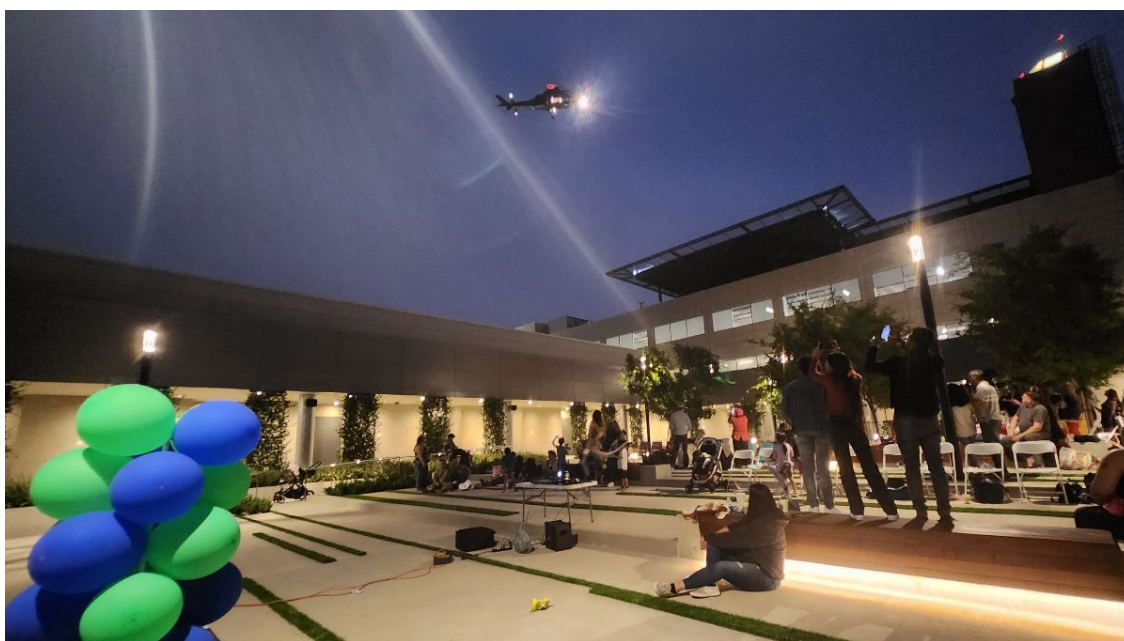
VIDEO: OneLegacy helicopter lifts off during Staff Event.

After hosting many events and conferences in OneLegacy's new Azusa home, it was time to take to the halls to celebrate the OneLegacy staff, Ambassadors, and their families who make lifesaving donations possible. Hundreds of the OneLegacy families joined together for grilling, face painting, games, a viewing of How To Train Your Dragon on an outdoor screen. Guests were also reminded of the power of their work when a helicopter took off over the event with a donor's gift heading to save the life of a waiting recipient.