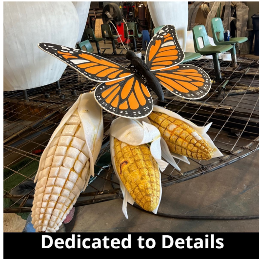
Dedicated to Details

There is so much more we're excited to share with you and we'd love for you to be a part of our mission to save lives in Southern California. Get involved: