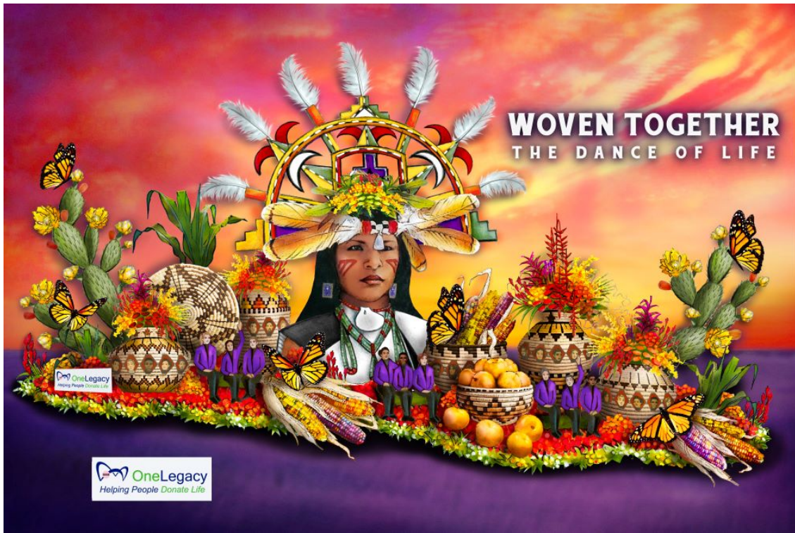
2024 OneLegacy Donate Life Rose Parade Float