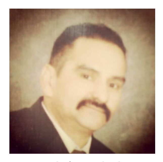
Example of poor quality photo